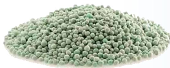
ENTE Nitrophoska Special